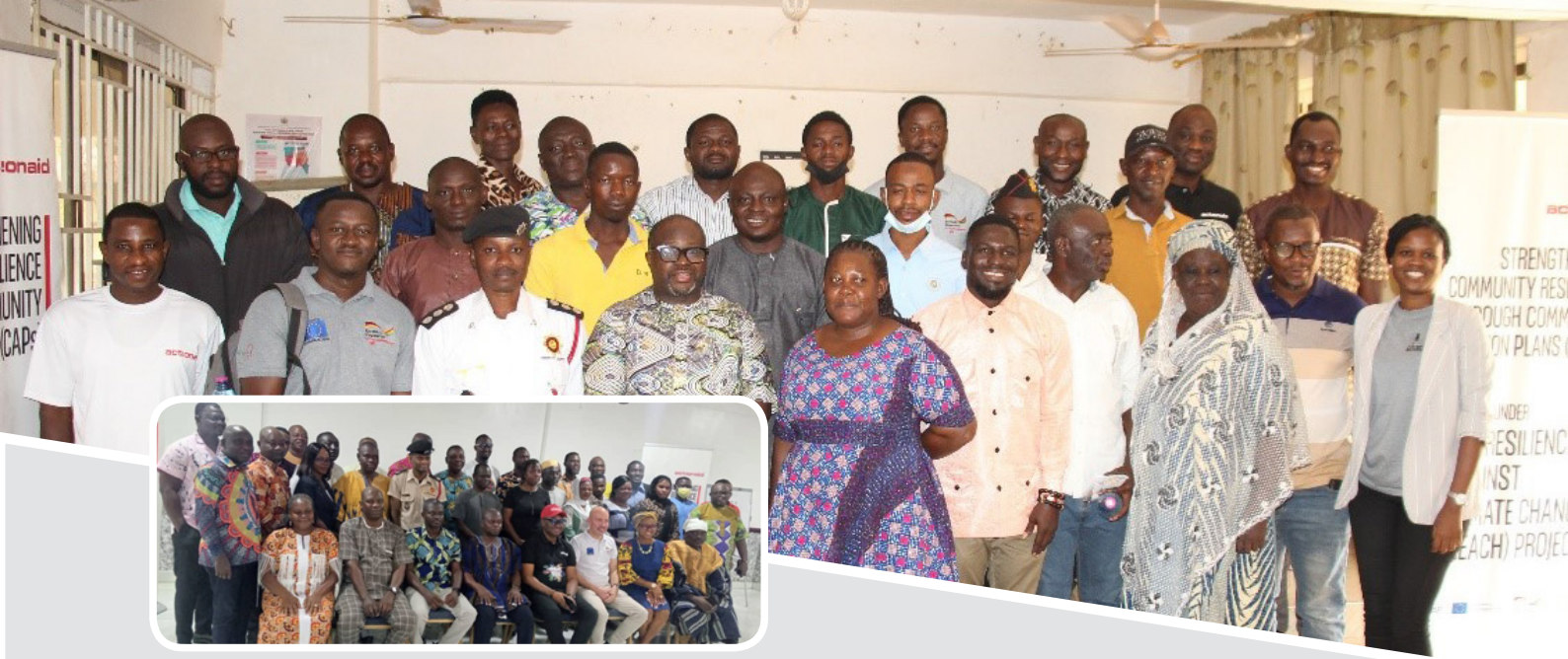
Guest at the launch of the CAPs project in the Upper West Region